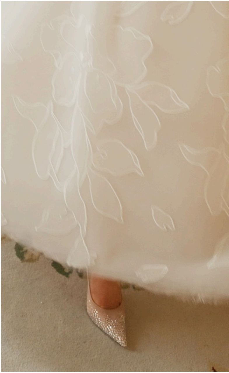
// Click to watch wedding short