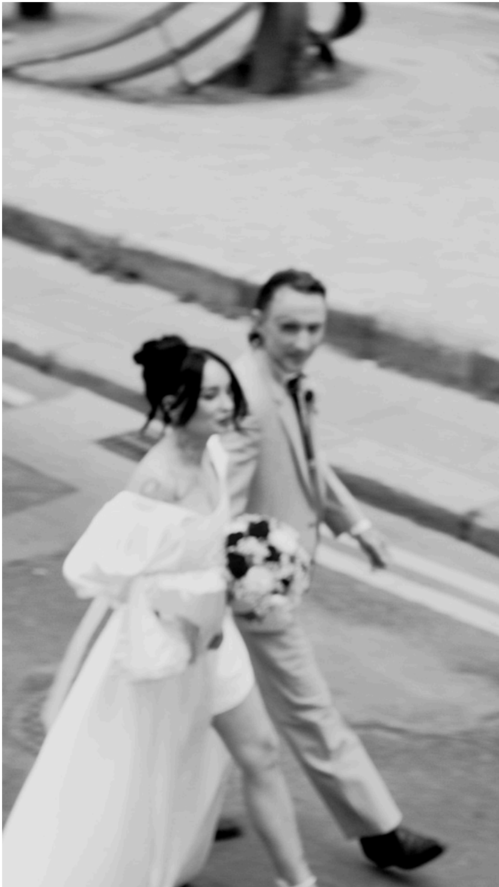
// Click to watch wedding short